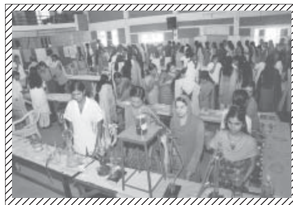
Exhibition Organized by Chemistry Students