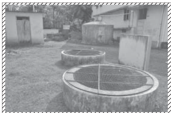
Rain Water Harvesting Tank