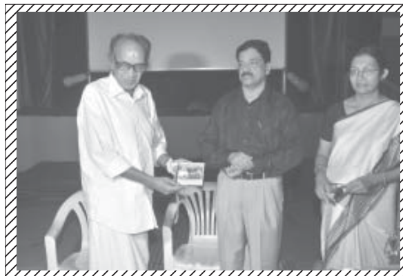
Release of 'THE IMPRINTS' - A CD on the Department of English