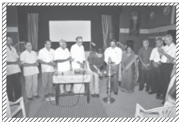
Former Faculty of the English Dept. with Pro-V.C.