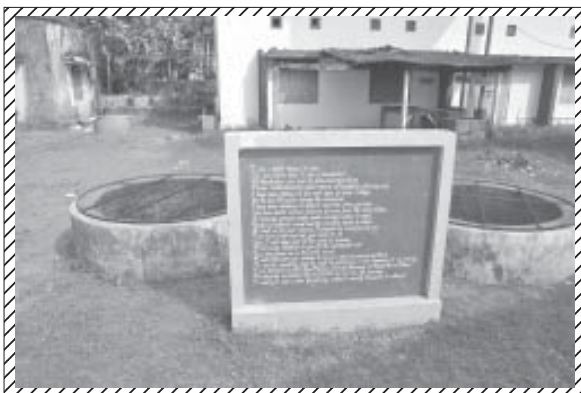
Pledge for Water Conservation