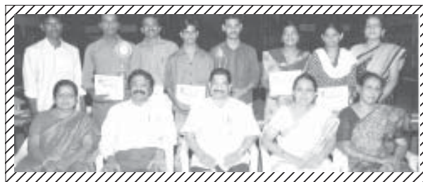
Winners of the Intercollegiate Mathematics Quiz with the Principal