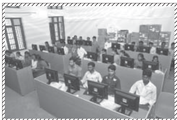
Computer & Language Lab