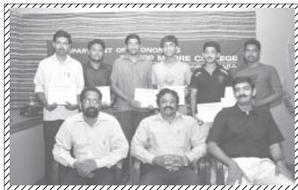
Quiz Winners with the Principal, Quiz Master and HOD