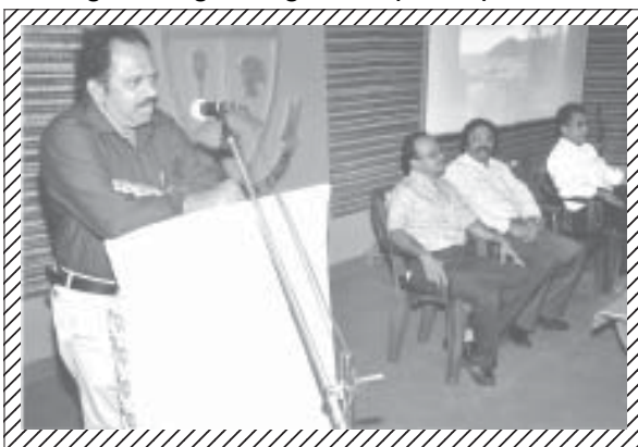
Talk on Nuclear Energy, the Indian Scenario